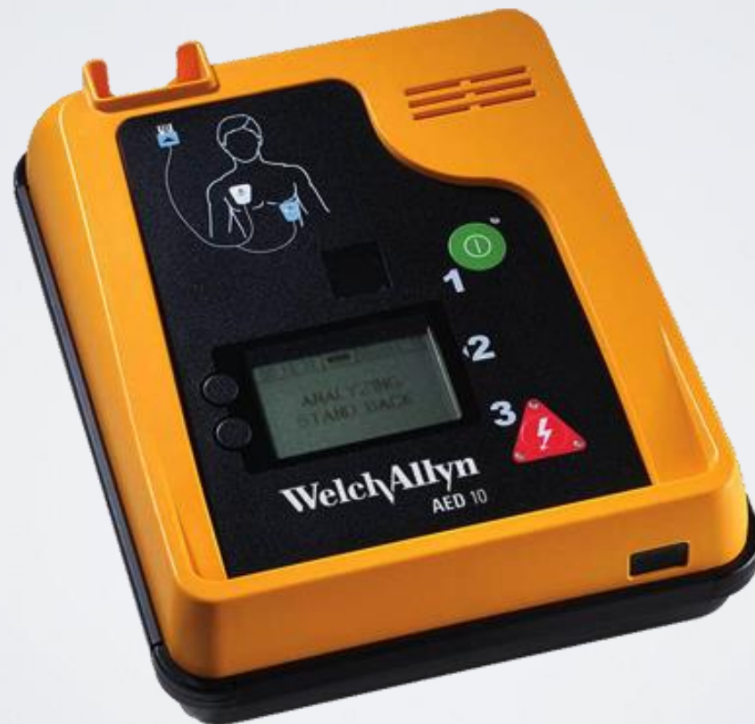
Welch Allyn AED 10