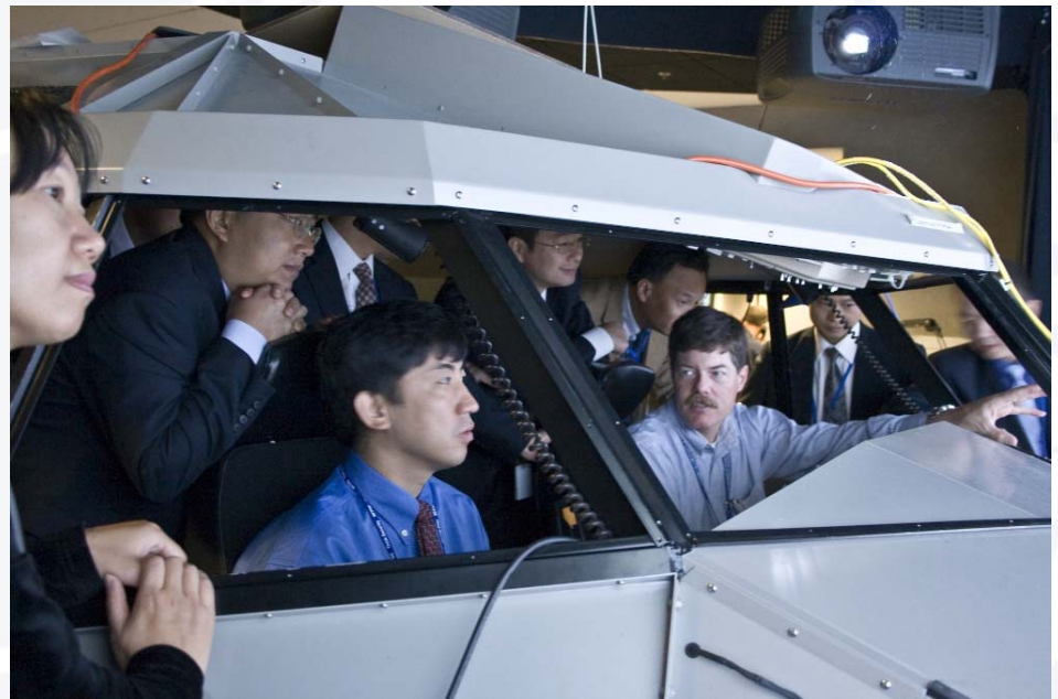
China Executive Management Development Training Program